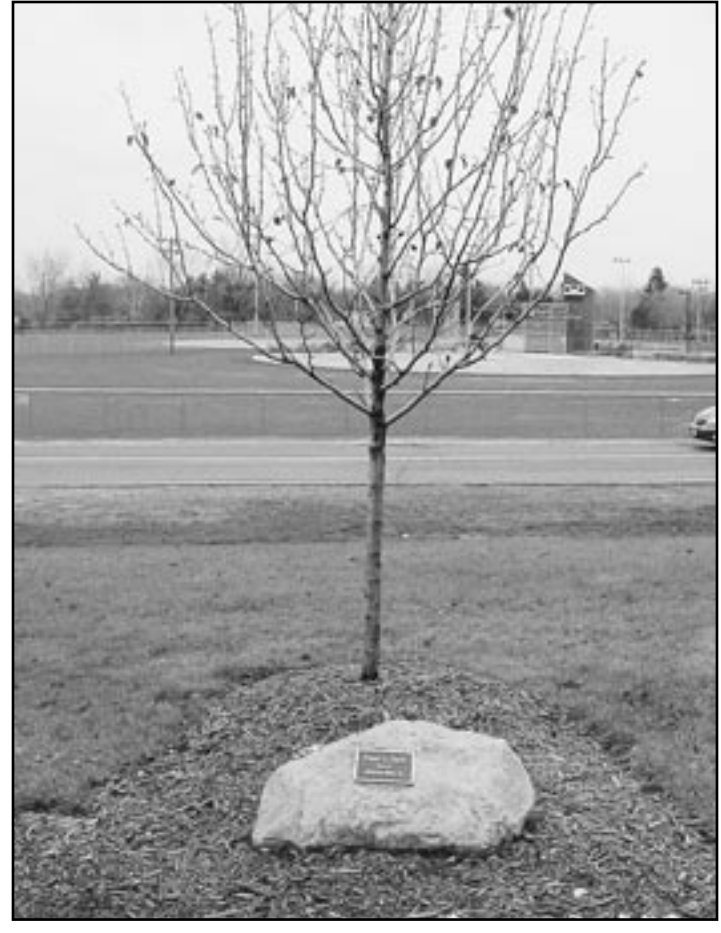
Memorial tree in Strongsville, Ohio

And as the city forester, I choose the species that gets planted. Take it or leave it. Some do, some don't.