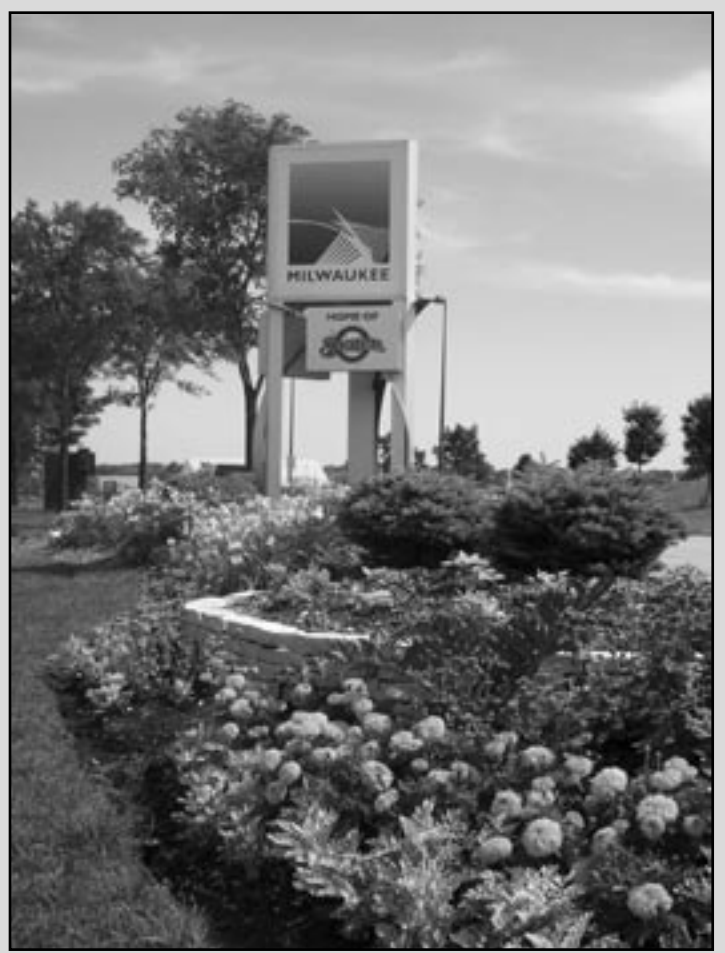
Milwaukee Gateway Signature Bed sponsored by the Milwaukee Brewers

Sustainable Boulevards is in its third year of a planned three-year conversion. During the first two phases Forestry removed approximately 1,200 low-impact landscape beds along 80 miles (128 km) of boulevard and added 200 new signature beds at strategic locations and approximately 2,400 new shade trees on connector boulevard segments. Phase III will be completed in 2010. The City's budget allocation of $1.5