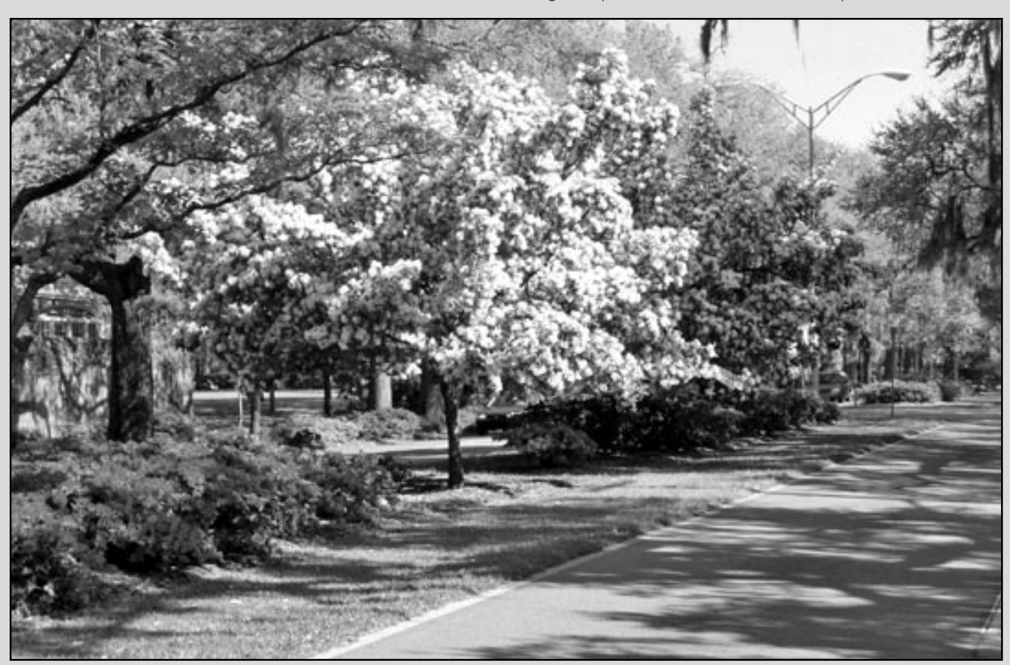
The lacy white blooms of Chinese fringetrees ( Chionanthus retusus ) contrast beautifully with 'Red Ruffle' azaleas against a backdrop of live oak along Abercorn median in midtown Savannah.