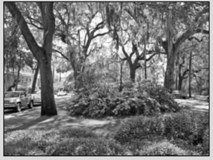
Azaleas ( Rhododendron sp.) and loropetalum ( Loropetalum chinensis ) offer a striking floral display, shaded by century-old live oaks along Oglethorpe median in downtown Savannah, Georgia. Savannah

often emphasize year-round seasonal color. Savannah is well known for its Southern live oak ( Quercus virgin iana ), which makes for a perfect dark green backdrop to tree species that offer a profuse spring bloom as well as striking fall color. My favorite is Chinese fringetree ( Chionanthus retusus ), which explodes in lacy white blooms in the spring and displays deep yellow foliage in the late fall/early winter months. Chinese fringetree also tolerates a wide range of soil conditions and exposures, while being resistant to breakage, insects, and disease. Ultimately, you know you've achieved success with median plantings when you receive dozens of calls and emails every year asking 'What is that and where can I buy it?'