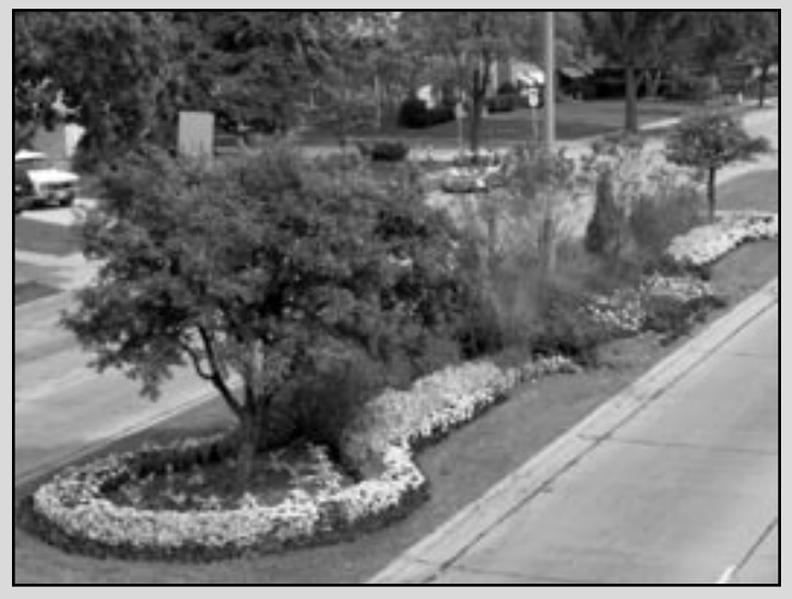
One of 300 new Signature Beds adorning Milwaukee's boulevards • Milwaukee Photos by Scott Baran

Forestry recognized that for the boulevard system to survive, significant restructuring would be necessary.