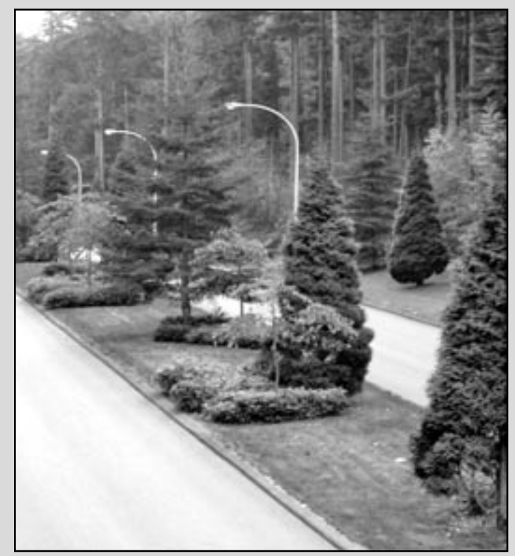
Mid-1990s Surrey median with no paved perimeter strip