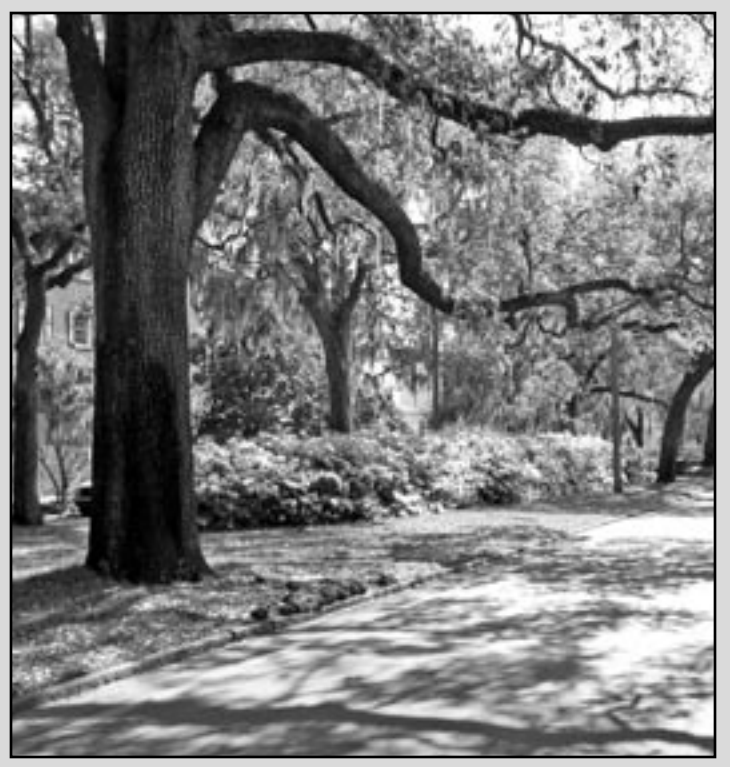
Savannah has a tendency to charm and mesmerize visitors through its beauty and history. A cathedral of live oaks ( Quercus virginiana ) draped in Spanish moss creates a shaded corridor along Liberty Street, with a colorful understory of mature azaleas.

Since Savannah generally has a well established tree canopy along the sides of its roadways, median plantings