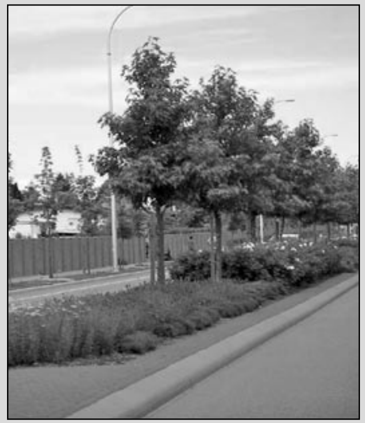
Recently developed median in Surrey British Columbia • Surrey Photos Courtesy Surrey BC Parks

The run-up to the new millennium marked a turning point for the City. In December of 1998 a team of City