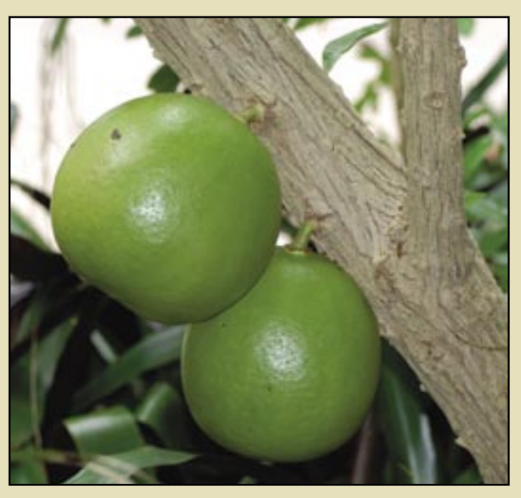
At Jungle Island in Miami, Florida, Director of Horticulture Jeff Shimonski has to be thoughtful about where he plants coconut palms (Cocos nucifera, left), calabash (Crescentia cujete, right), and sausage tree (Kigelia africana, next page). Some coconut palms produce over 100 fruit a year; this coconut already had all the fruit cut off once this year. The fruit of the calabash is not edible but can grow as large as a basketball.

Tropical Fruit Trees in the Urban Forest. These past few weeks we have been pollinating our sausage trees (Kigelia africana) at Jungle Island here in Miami, Florida. This striking tree is found in many of the older areas of Miami, but usually it is not noticed because there are no fruit hanging from the branches. In its native habitat in sub-Saharan Africa, pollination of the night blooming flowers is done by bats. We don't have these bats in south Florida, but occasionally woodpeckers or the introduced spot-breasted oriole will provide the service when they find opening flowers in early evening.