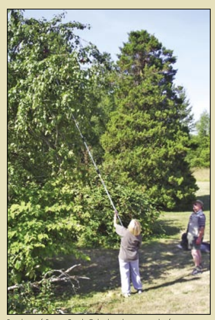
Residents of Surrey, British Columbia, harvest apples from a municipal tree.

I will be upfront. My recommendation would be against the use of parkstrip for fruit trees in the scheme of "edible streets." The reason is right in the name: fruit. All trees,