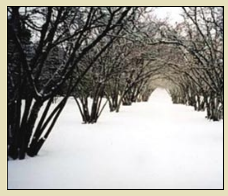
A remnant of a former filbert plantation ( Corylus avellana ) has been retained during the development of a botanical garden in the City of Surrey. The filberts bear loads of nuts that are collected by the volunteers who help manage the garden.