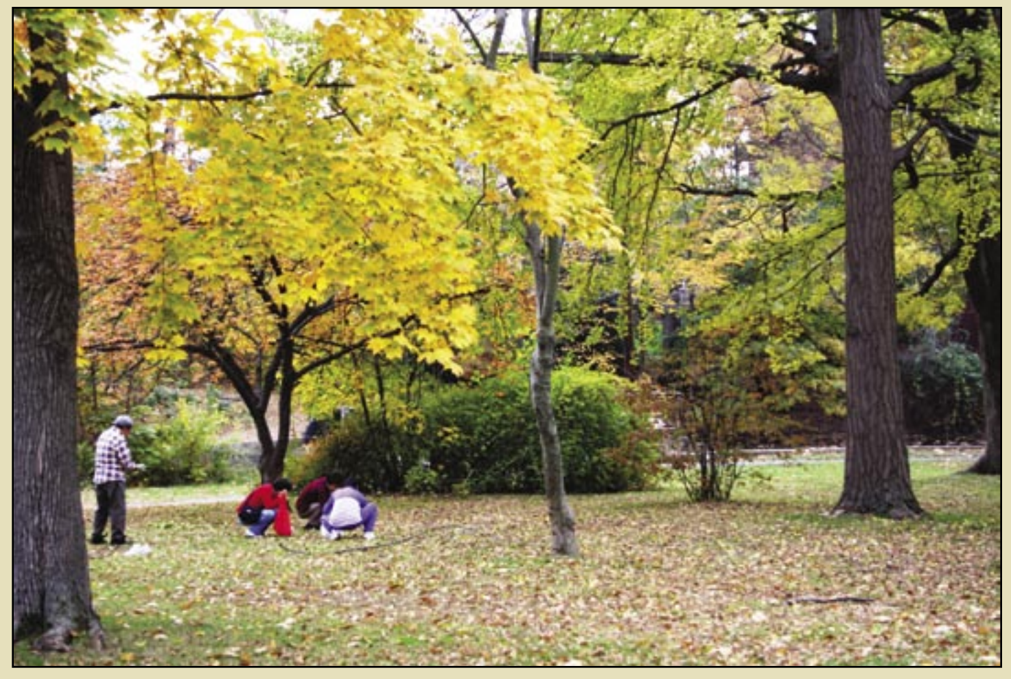
Ohioans enjoy picking gingko fruits (above) and cherries (bottom right).

trees to become? How will you deal with the liability of volunteers climbing 14 foot orchard ladders to reach upper fruit? How will dwarf fruit trees affect visibility along the streets?