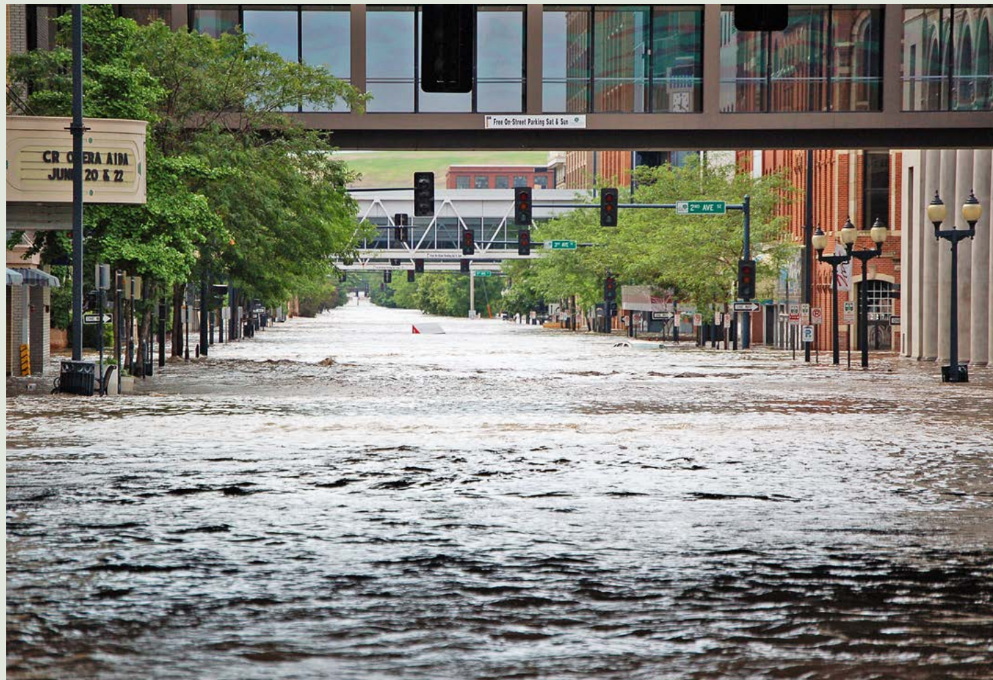
Flooding in Cedar Rapids, Iowa in 2008 penetrated 14 percent of the city.

Starting the year after the flood, trees began to decline. For the next several years, trees were removed as they succumbed to the effects of the flood. While most of the trees were older or had already been under some sort of stress, the losses occurred across all species. Each year, all dead and dying trees were removed from these areas. The following year however, trees that appeared to be healthy during the previous inspection were in serious decline or were dead. These losses continued for the next four years, with most of the removals occurring two to three years after the flood. The area finally stabilized in 2012.