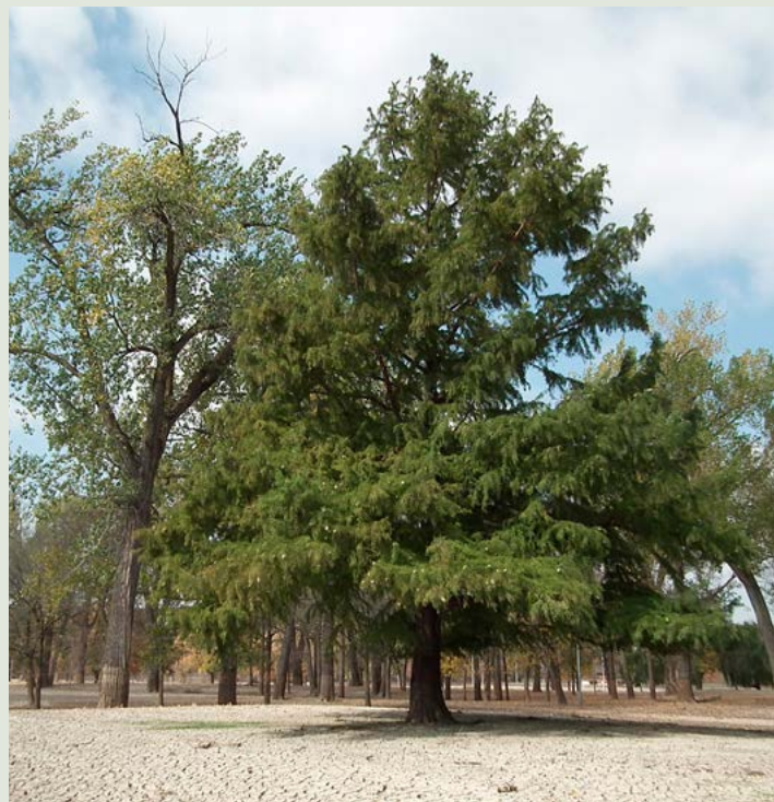
Baldcypress tree standing tall in Omaha, Nebraska after the 2011 flood, with flood line visible on the nearby stressed cottonwood trees.

—Graham Herbst, Community Forestry Specialist, Nebraska Forest Service