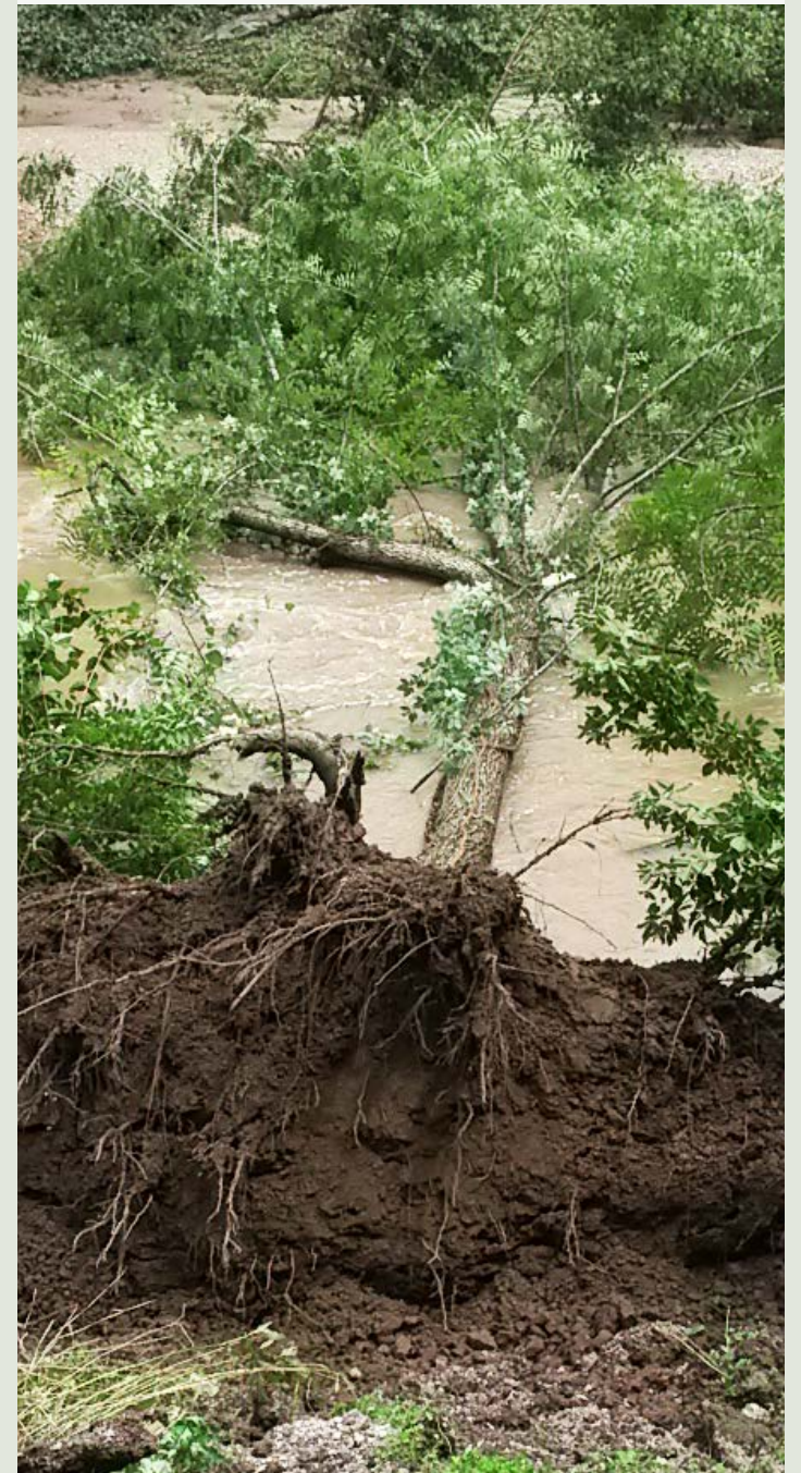
The toppling of streambank trees is one of the classic symptoms of “Urban Stream Syndrome,” a term that covers a number of ill effects of flooding on urban waterways.