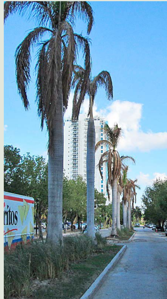
Royal palm trees in Miami Beach, Florida, showing leaf burn due to salt water flooding.

To address the significant issues caused by storm-related flooding, sea level rise, and high tides, the City has embraced a new comprehensive strategy. It includes additional storm water pumping stations, raised sea wall and road elevation projects, adoption of a robust climate resiliency plan, and revisions to the City's reforestation program, including planting standards.