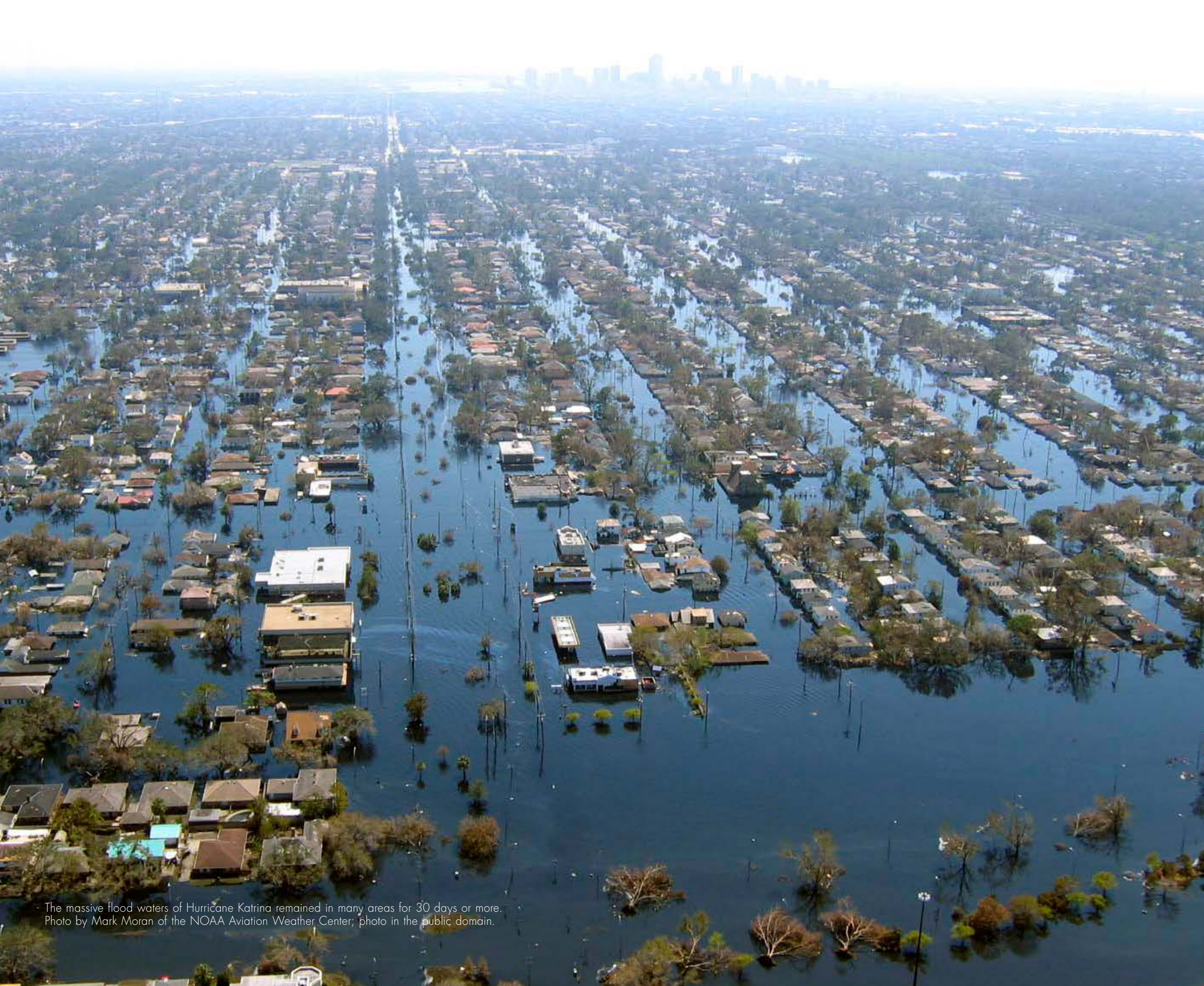
The massive flood waters of Hurricane Katrina remained in many areas for 30 days or more.

Hurricane Katrina (August 2005) pushed huge amounts of brackish water on land that lingered for 30 days or more in New Orleans and greater southern Louisiana. Our company, Bayou Tree Service, is full-service but has specialized in historic tree preservation—especially that of live oaks—since 1980. Our crews were able to get into New Orleans starting four days after Katrina and worked many months, in extreme conditions, on tree clearing and hazard mitigation.