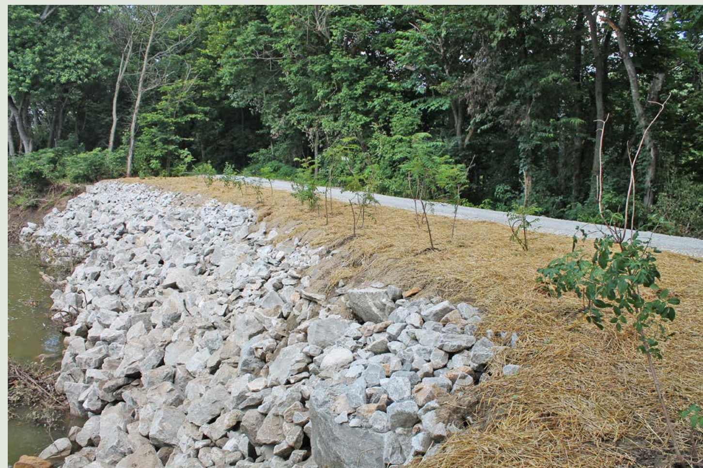
Streambed restoration on Hinkson Creek in Columbia, Missouri. The crest of the bank was seeded with river oats ( Chasmanthium latifolium ) and planted with stoloniferous (suckering) multi-stem native shrubs such as elderberry ( Sambucus canadensis ) and staghorn sumac ( Rhus typhina ) to quickly establish a network of anchoring roots. The creek has since been slowly depositing silt in the gaps among exposed boulders, which will allow Columbia to plant this rocky bank with sandbar willow cuttings this spring.

Almost 1400 tons (1270 metric tons) of boulders were needed to stabilize the bank, and over 36 tons (33 metric tons) of topsoil were spread along the crown of the bank before we replanted with