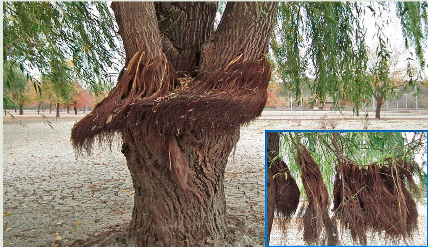
In Nebraska, weeping willows responded to the prolonged 2011 flooding by forming massive aerial root masses from both the trunk and submerged branch tips.

a flooded property had ten cottonwoods averaging 5 feet (1.5 m) in trunk diameter that needed to be removed. Those cottonwoods that had been caught in the cool, oxygenated river waters fared better than those growing inland where warm, shallow water was trapped at their bases.