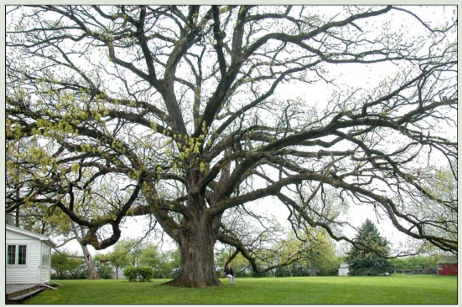
Sturdy oaks withstand extreme weather events better than many other species. This bur oak (Quercus macrocarpa) was photographed by Guy Sternberg; note tiny human for size reference.

tor. They are performing better in partial shade with protection from drying winds. Organic mulch has improved their thriftiness by moderating seasonal soil temps. A severe storm that produced golf