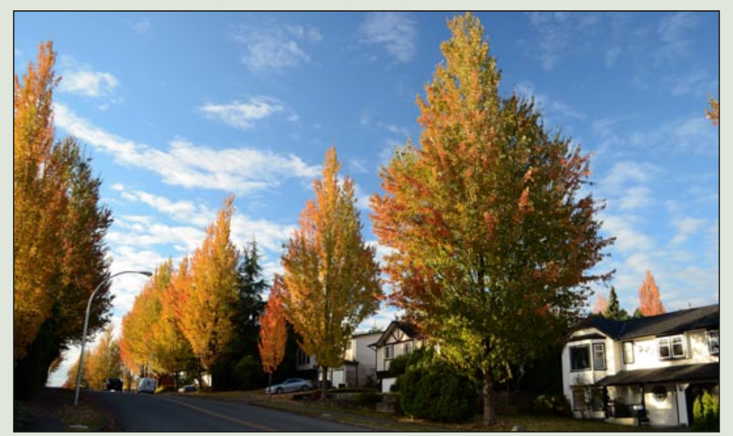
Armstrong maples (Acer x freemanii) have endured drought well in Surrey, BC.

The number of weeks watered and the ages of trees watered are strong indicators of the severity of drought experienced in Surrey over the last number of years. The "3-Year Moving Average" chart illustrates the trend of the increasing number of weeks watered between 2008 and 2013. For all age categories (except 7- & 8year-old trees), the number of weeks watered, on a 3-year moving average basis, has increased.